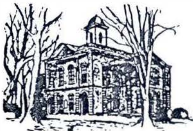
LOUDON COUNTY COURTHOUSE LOUDON, TENNESSEE ERECTED 1872